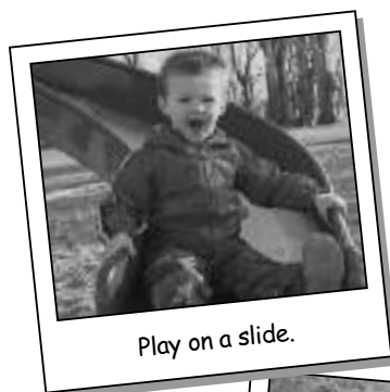
Play on a slide.