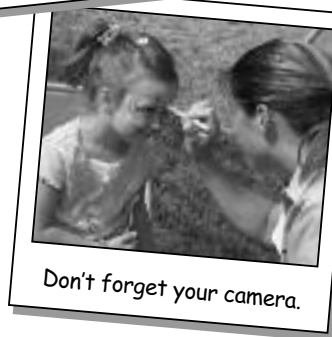
Don't forget your camera.