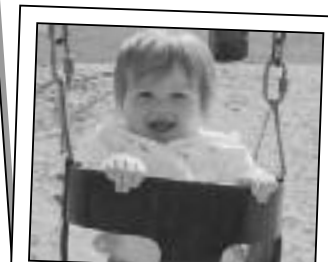
Lots of laughter.