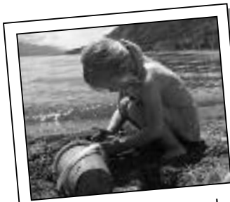
Discover something new!