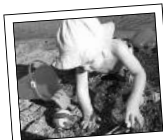
Play in the sand.