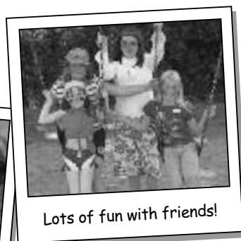
Lots of fun with friends!

All Play Days take place from 9:30-11:30am.